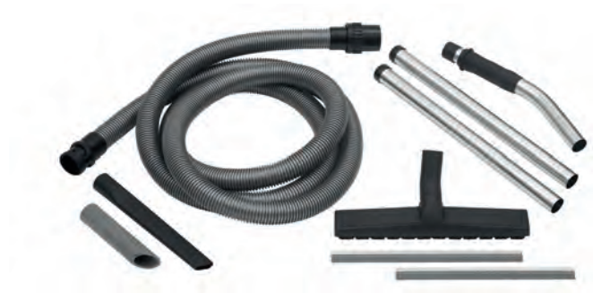
Hard floor squeegee kit