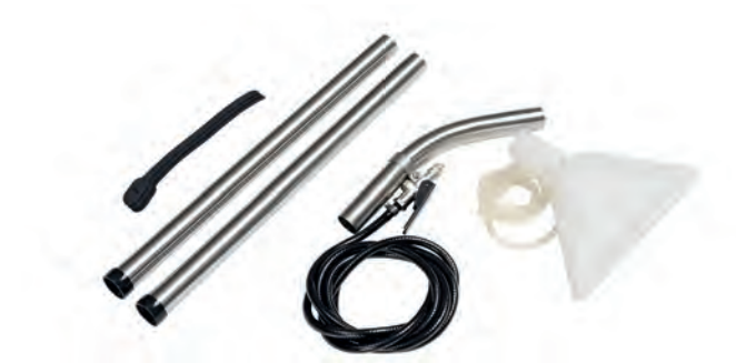
Carpet accessory kit